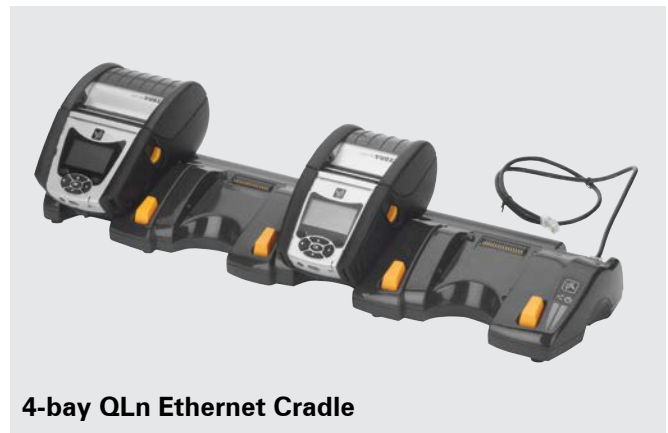
4-bay QLn Ethernet Cradle