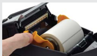
Intuitive peeler operation