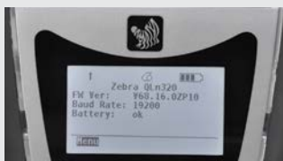
Easy-to-read display with larger, higher-resolution screen